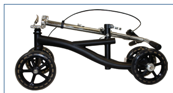
Folds Flat for Easy Storage

The Roscoe Knee Rollator offers increased comfort and ease of mobility to patients who cannot put weight on their foot or ankle, but want to remain active. With its four large wheels and padded knee platform, the Knee Rollator is perfect for indoor and outdoor use. The offset post on the aluminum knee platform allows for right-to-left adjustment in seconds - no tools required. The Knee Rollator is equipped with an easy folding mechanism that collapses using a thumb release lever and its beneath the raised knee platform for ease of storage and transportation.