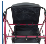
Water-Resistant Nylon Pouch

The ProBasics Deluxe Aluminum Rollator has large 8-inch wheels for improved maneuverability and is ideal for outdoor terrain. The padded seat and removable padded backrest provide a comfortable resting area. It features easy-to-operate ergonomic hand brakes, a water-resistant nylon pouch, and a built-in fold strap for easy storage and transport. Supports patient weights up to 300 pounds.