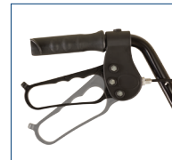
Easy-to-Operate Ergonomic Hand Brakes